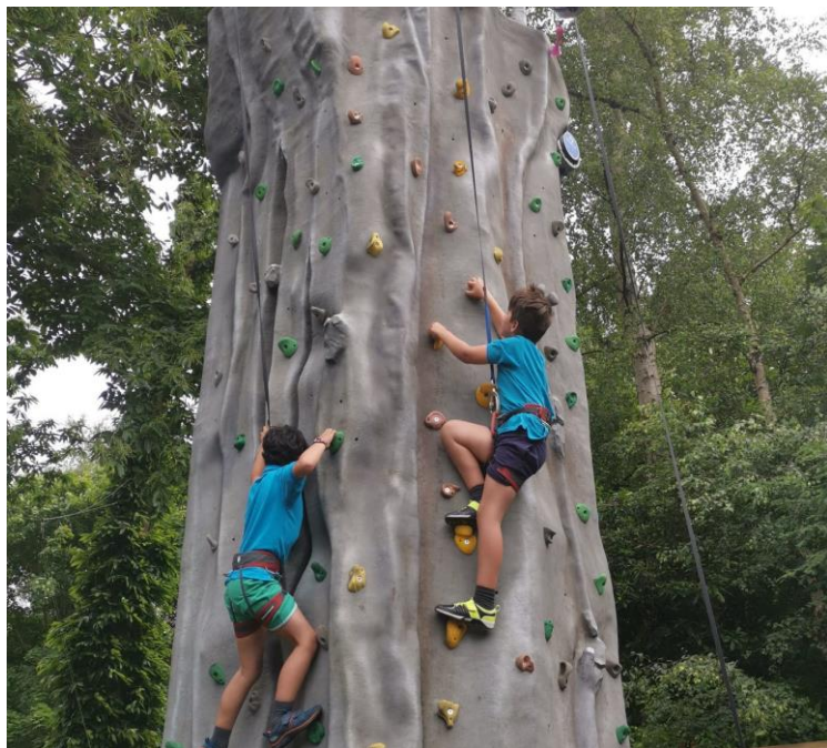
Two Beavers take on the Croydon District climbing wall at Pinewoods