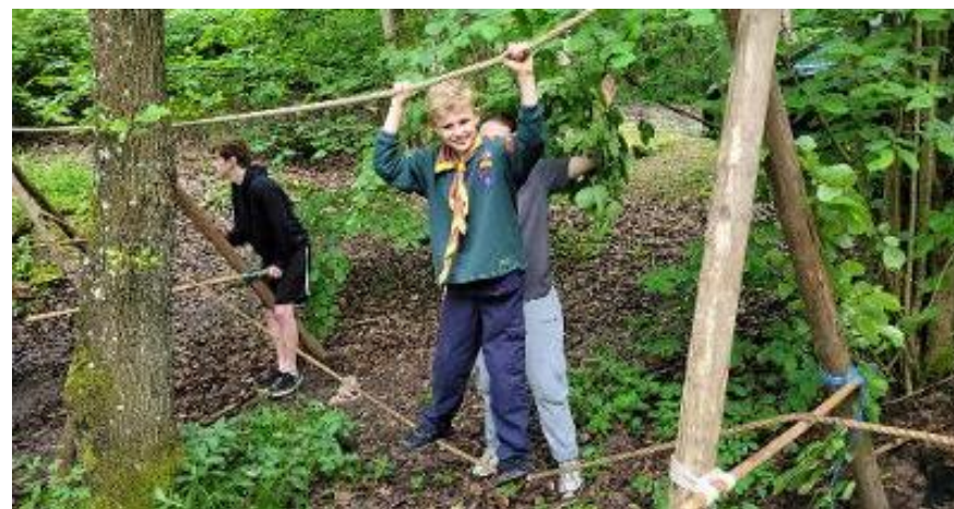
A cub, at Frylands Wood, using a rope bridge he has just built!

Thankfully we have now returned to face-to-face meetings. Below are some scout action shots of the Beavers and Cubs doing what they do best: