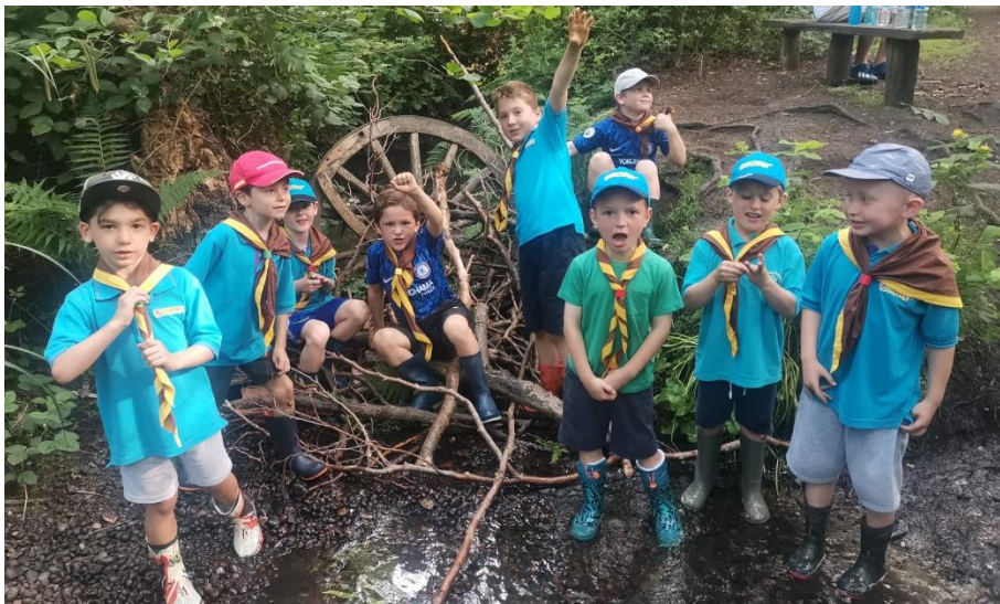
The 7 th West Wickham Beavers "Dams Colony" building a Dam!

Scouting is a lot of Fun. Beavers are aged 6 to 8 years, Cubs are 8 to 10½ years, Scouts 10½ to 14 years and Explorers are 14 to 18 years. Scout membership is completely open at all ages to girls and boys.